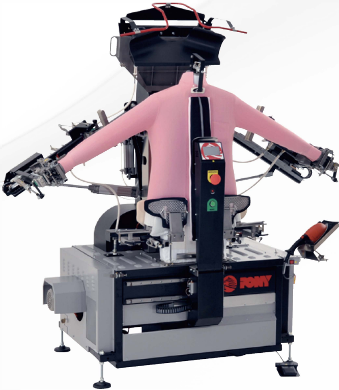
EAGLE 2.0 SHIRTS