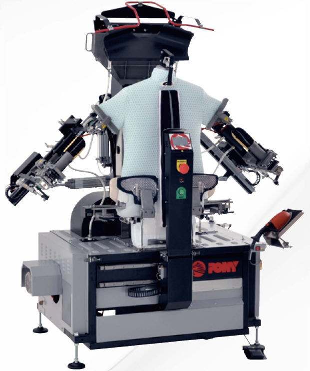
EAGLE 2.0 WITH SHORT-SLEEVE DEVICE