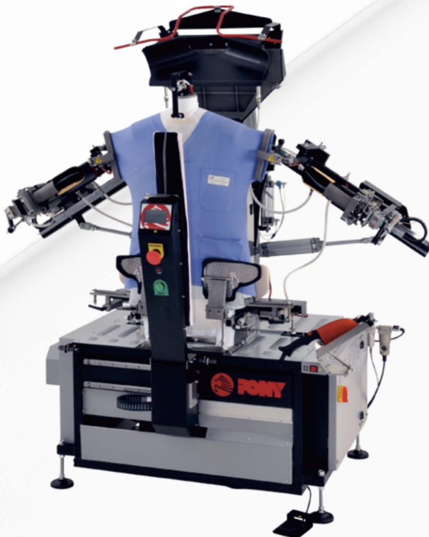
EAGLE 2.0 MEDICAL UNIFORMS